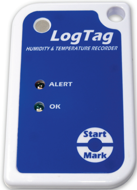
Product code: HAXO-8 (Approximate actual size)

The LogTag Humidity & Temperature Recorder measures and stores up to 8000 sets of high resolution humidity and temperature readings over 0 to 100%RH & -40°C to +85°C (-40°F to +185°F) measurement ranges.